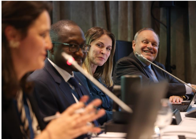
Government officials leading water sector reform and policy.

Applications are welcome from senior leaders involved or interested in water sector reforms , including: