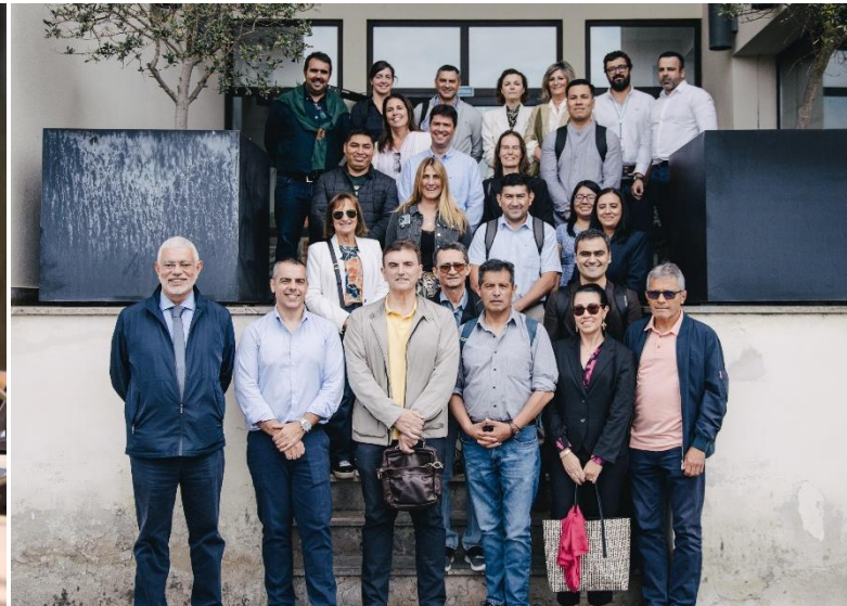
Leaders and senior managers of regulatory authorities.